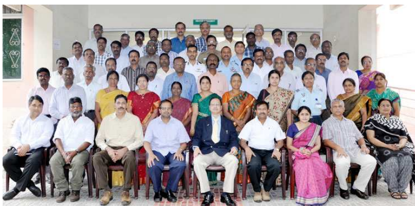
Group Photograph of State Level Workshop on "Formulation of State Disaster Management Plan at AIM Chennai.

Mainstream DRR in departmental plans. Fifty five