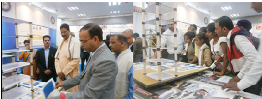
Demonstration of Earthquake impact at the stall through Building Model and Shake Table for Liquefaction