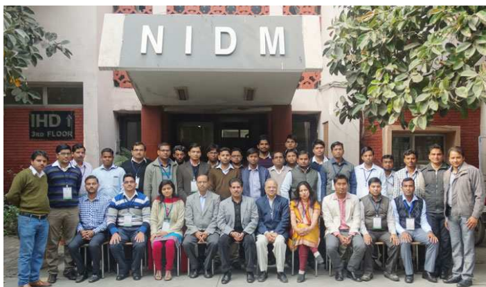
Group photograph of Participants