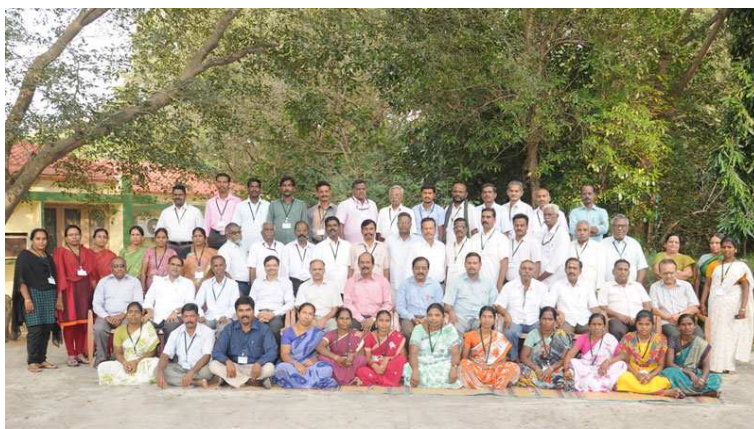
Group Photo of the Training of Trainers Programme on "Community Based Disaster Risk Management"

NIDM in collaboration with SIRD Tamil Nadu organized a five days Training of Trainers programme on "Community Based Disaster Risk Management" during 16-20 December, 2013, at State Institute of Rural Development, Maraimalai Nagar, Tamil Nadu.