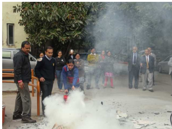
Staff of NIDM participating in fire fighting mock drill.

NIDM conducted mock drill for fire fighting on 20 th December 2013. The drill was conducted in order to teach the correct use of fire extinguishers. The demonstration was conducted by trained personnel. They demonstrated three types of fire extinguishers i.e., Type A, B and C. They also explained the use of these three types of extinguisher in different type of fire breakout. All faculty members and staff of NIDM were present during the drill, including Executive Director of NIDM.