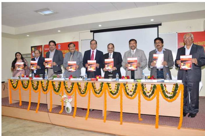
Release of souvenir during the inaugural Session of the National Seminar.