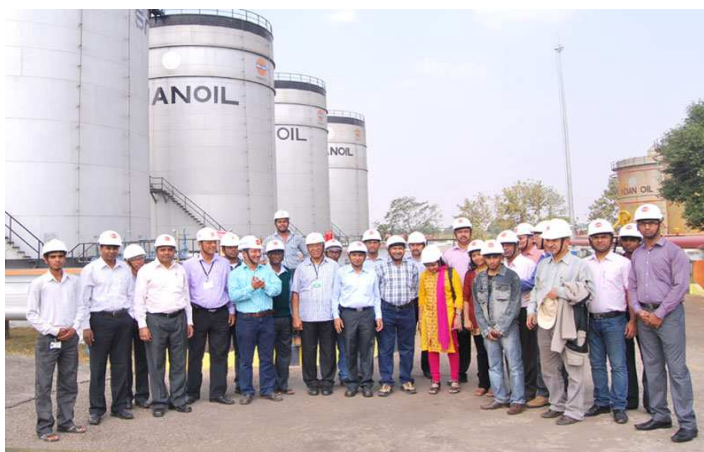
Industry visit and mock drill at IOCL Jatni