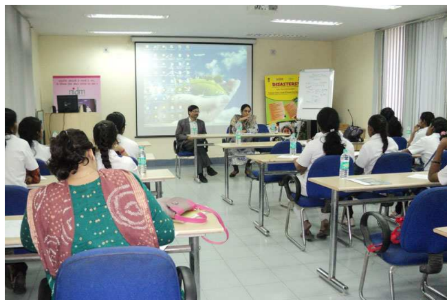
Interaction session with students from Sadhu Vaswani College of Nursing.