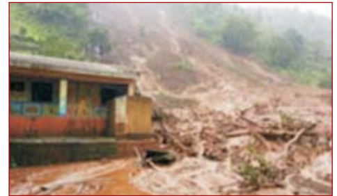
Malin village after the landslide

in their houses. The cloudburst that followed the two days incessant rains triggered the landslide that engulfed more than 150 persons. More than 40 houses got amalgamated in the landslide debris after these were hit by the landslide. The landslide initiated from the top of the hillock and moved up to the river level, thereby blocking the road with debris. The landslide was first noticed by a bus driver who drove by the area and saw that the village had been overrun with mud and debris.