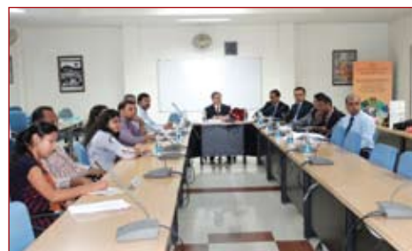
Delegates from the Republic of Mauritius and AARDO during the visit

Top Level Delegates from Afro-Asian Rural Development Organization (AARDO), Mauritius High Commission at New Delhi and officials of National Disaster Risk Reduction and Management Centre (NDRRMC), Mauritius Government visited NIDM on 10th September 2014 for meeting and discussion on "Disaster Risk Reduction and Management". It was an information exchange meeting that focused on collaboration for Disaster Resilience in AARDO countries, Mauritius and India. Discussion included the aspects of Training Programmes, Disaster management setup in both the countries, documentation and policy research, etc.