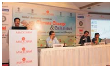
Executive Director, NIDM addressing the gathering during the summit