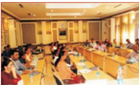
Participants during the Pre-conference

National Institute of Disaster Management (NIDM) in collaboration with Maulana Azad Medical College, Department of Community Medicine organized a two days Pre-conference Training Workshop on “Environmental Health Disasters - Risk Analysis and Planning” during September 24-25, 2014 at NIDM. Fifty-nine delegates from various medical colleges of India, Social Sector as well as Armed Force Medical College attended the workshop. Several topics related to Disaster Management, Occupational and Environmental