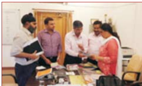
Interaction of NIDM Officials with Institute for Visually Handicapped

perspective. The NIDM intends to develop content and IEC material based on research and experience for the most vulnerable people with disability before, during and after disasters, and aims to build the capacity and skill of the disabled people.