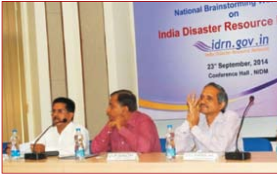
Executive Director, NIDM and JS (DM), MHA during the National Level Brainstorming Workshop on IDRN