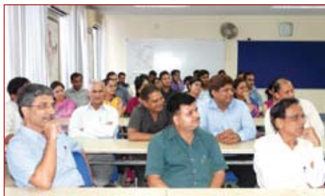
NIDM officials during the meet