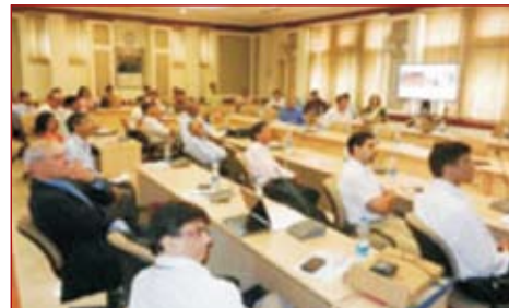
Participants from hospitals' administration during the workshop