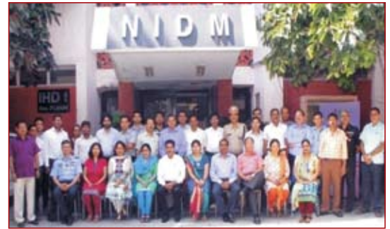
Participants during the National Level Brainstorming Workshop on IDRN