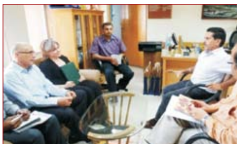
ED, NIDM leading the discussion with ICRC representatives