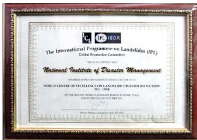
NIDM certified as WCoEs by the GPC of IPL-ISDR and ICL during the 2nd World Landslide Forum

GPC of IPL-ISDR and ICL. This title of WCoE-LDR has been conferred for the period between 2011 and 2014, after which the progress/achievements will be reviewed for extending this