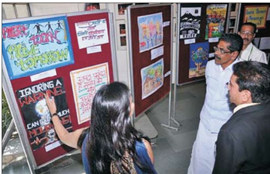
Shri Mullappally Ramachandran, Honorable Minister of State for Home Affairs inspecting the award winning entries of various categories i.e. poster, slogan and paintings at India International Centre on Disaster Reduction day

er dignitaries, officials and children. Representatives of Civil Society, UN, NGO & World Bank also participated in the event.