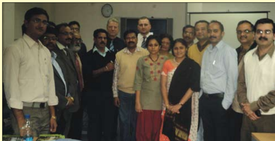
Executive Director NIDM, GIZ-NIDM Course team and participants

centers of universities, faculty members of National and State Institute of Rural Development (NIRD&SIRDs), CSIR and leading NGOs attended the course. The course was found effective in developing skills on how to design a Blended-learning course and to facilitate on line/ blended learning courses using various communication tools, moderating discussion, evaluation of performance and so on. Example of Environmental Statistics for DRM in India was demonstrated during the course.