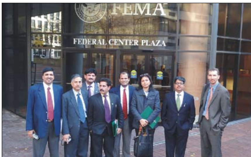
Indian Delegation in front of FEMA Office, USA