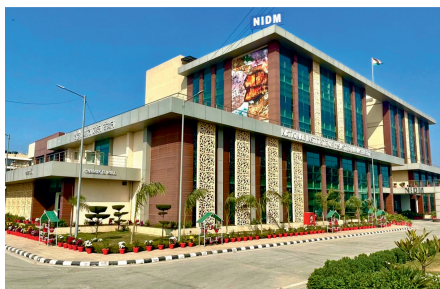
NIDM Campus, Sector 29, Rohini, Delhi

For details please visit the institute website: www.nidm.gov.in