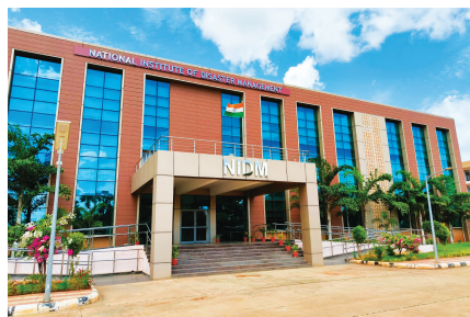
NIDM Southern Campus, Krishna District, Andhra Pradesh