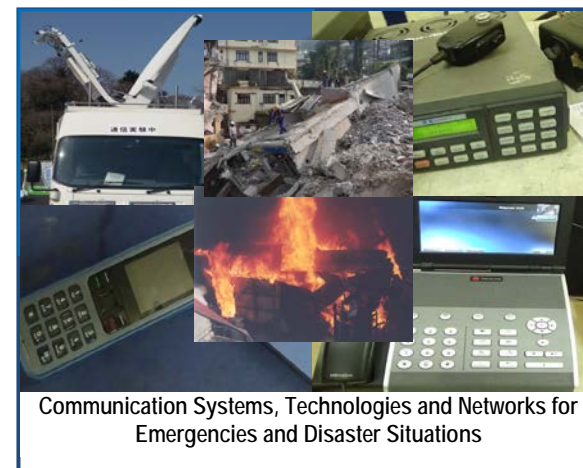
Communication Systems, Technologies and Networks for Emergencies and Disaster Situations

(16–20 July 2018 at NIDM South Campus, APHRDI, Bapatla)