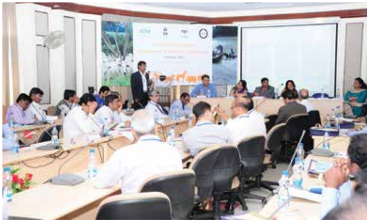
Government officers from 20 states attended the workshop