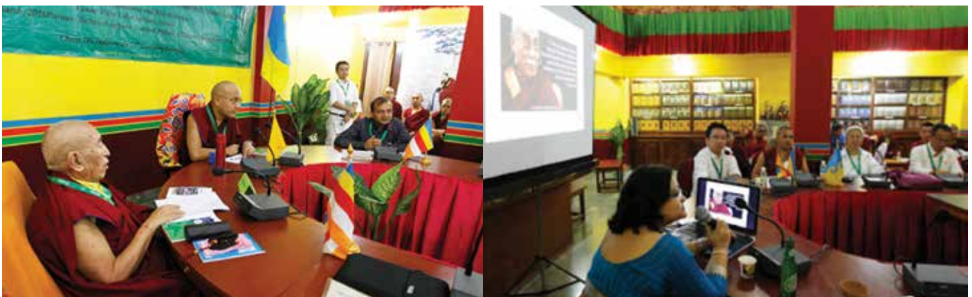
Experts sharing their expertise on various aspects of Disaster Management with participants during Khoryug conference

The third day centred on bringing the threat of disaster into reality through experiential hands-on training and disaster scenario planning. Following a session on first aid training, the participants were