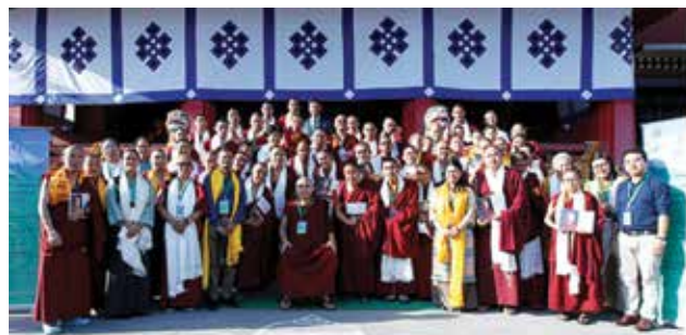
Participants representing various monasteries and nunneries from India, Nepal and Bhutan participated in the conference

The fourth and final day of the Conference concluded by synthesizing the past three days into disaster management plans. NIDM presented a framework for approaching short term and long term recovery that encompasses the effects of disaster on both humans and valuable monastic texts and relics. Thereafter, the participants presented their framework for disaster management planning for their monasteries and nunneries.