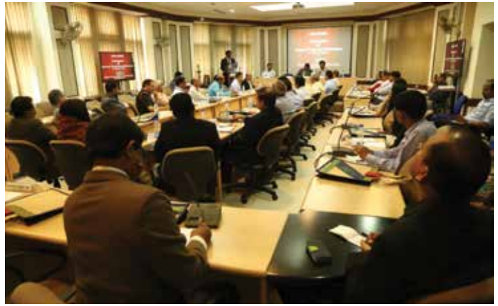
Participants from various Central and State Organizations attended the ATC