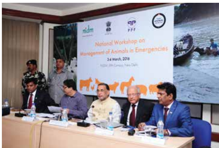
Shri Radha Mohan Singh, Hon'ble Union Minister of Agriculture and Farmers Welfare with other dignitaries during inaugural session of the workshop

Hon'ble Union Minister of Agriculture and Farmers Welfare, Shri Radha Mohan Singh inaugurated the workshop. In his inaugural address Honorable Union Minister highlighted the significance of animals in