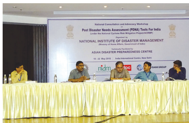
Delegates having a talk during the workshop

A National Consultation and Advocacy Workshop on Post Disaster Needs Assessment (PDNA) for India under the National Cyclone Risk Mitigation Project was organized at India International Centre, New Delhi, from 18-22 May, 2015, to present the draft PDNA Handbook for India as the key output of the study and seek feedback and approval. The ADPC team facilitated the consultation and advocacy workshop in close consultation with the PIU. The Workshop was attended by 43 participants, from various states, representing various sectors.