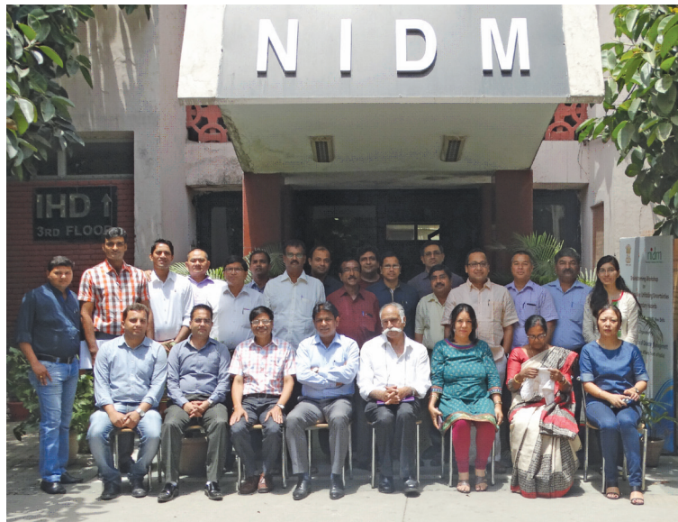
Participants of the ToT Programme