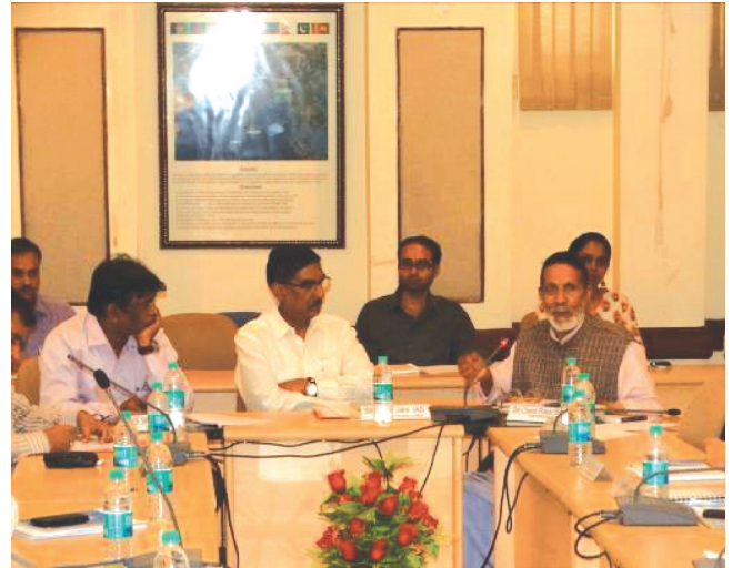
Delegates communicating their experiences in the workshop

The brainstorming workshop concluded with the major recommendations for immediate, short and long term actions. Few of them are mentioned below: