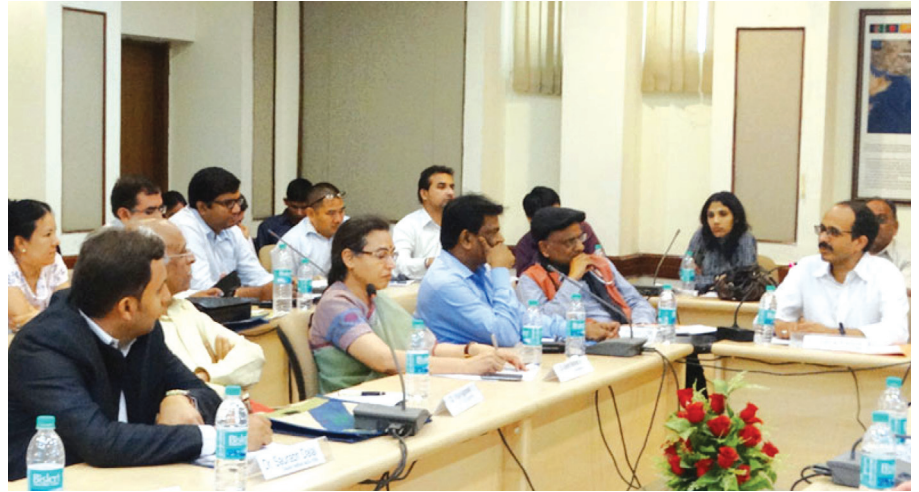
Participants discussing strategies for DRR in health sector during the workshop