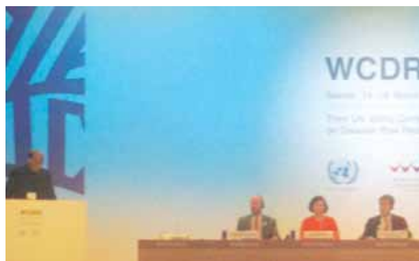
Shri Rajnath Singh, Union Home Minister, Government of India delivering his country statement at the 3 rd WCDRR

Third United Nations World Conference on Disaster Risk Reduction was held in Sendai City of Miyagi Prefecture in Japan from 14 th – 18 th March 2015. Delegates from all over the world participated in the event to share their experiences gained through the regional and national strategies/institutions and plans for disaster risk reduction to reduce disaster losses of lives and assets worldwide. NIDM, one of the premier institutes in the field of disaster management also participated in the conference. H. E. Shri Rajnath Singh, Union Home Minister, Government of India delivered a speech during 3 rd UN World Conference on Disaster Risk Reduction.