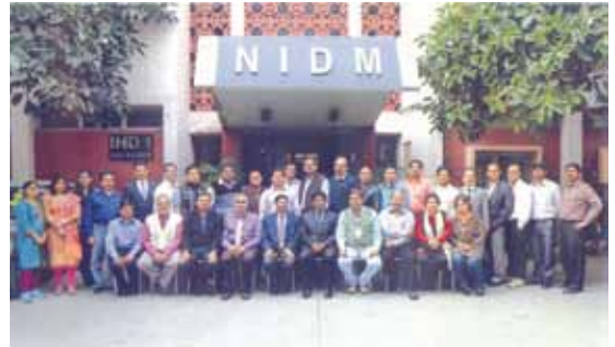
Programme Participants and NIDM Faculty

A five day ToT Programme on "Hospital Disaster Management Plans : Focus on Emergency Health Services" based on the training module developed as a part of NCRMP project was pilot tested at NIDM during the period 16 th – 20 th February 2015. Senior level Doctors/Administrators from various prestigious medical Institutions from across India as well as National centre for Disease Control, National Disaster Response Force, and National Civil Defense College participated in the training.