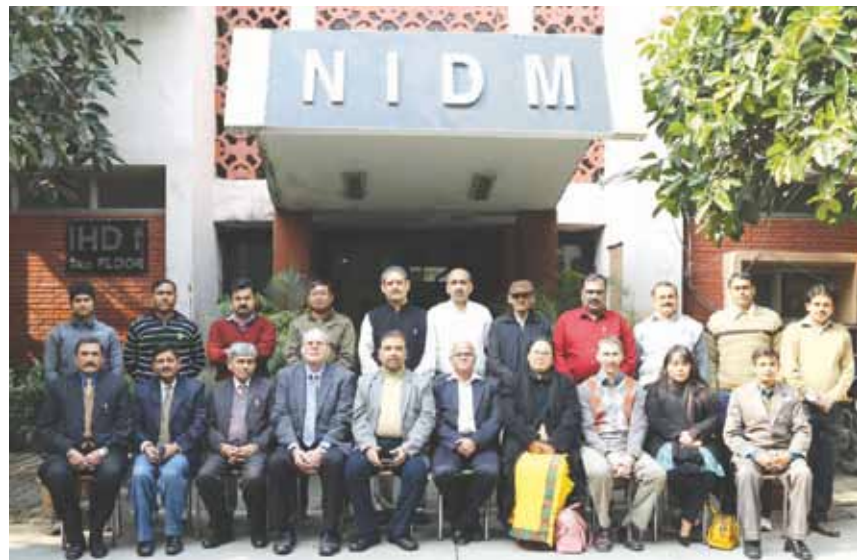
Group photograph of the Training of Trainer program on IRS- “Planning Section Chief”

NIDM organized five days Training of Trainer program on Incident Response System “Planning Section Chief” from 12-16 January, 2015 at New Delhi. Fifteen participants from all over India in different States like Arunachal Pradesh, Chhattisgarh, Delhi, Goa, Jharkhand, Kerala, Punjab, Tamil Nadu and Tripura participated in the training. Various line departments attended this ToT course like, Secretary- Disaster Management, Director - Disaster Management, DIG of Police, Assistant Divisional Officer- Fire and Rescue Service, Additional Principal Chief Conservator of Forests, Deputy Collector, IG of Police, Assistant Commandant, Supt. of Police etc.