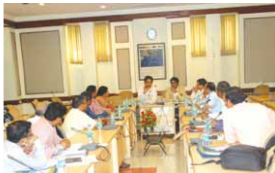
Delegates during the brainstorming meeting