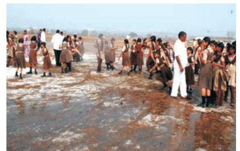
Hailstorm and untimely rainfall damaged crops in the region.

In Andhra Pradesh, nine persons were killed and over three thousand injured due to hailstorms and untimely rains. Several parts of Telangana and Rayalaseema regions received hailstorms causing heavy losses to livestock and damages to agricultural produce. According to the State Disaster Management Commission, six persons died and over three thousand were injured in Warangal district alone while two died in Ananthapur and one more in Nizamabad districts due to hailstorms. About 1400 livestock losses were reported while over 500 houses were damaged. It was reported that Crops like Paddy and Maize besides oil seeds and pulses in nearly 73 thousand hectares and horticulture crops in nearly 28 thousand hectares were damaged in 10 districts of Andhra Pradesh.