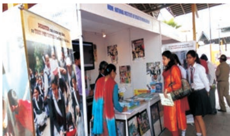
NIDM at “AAGAAZ” Fair

National Institute of Disaster Management (NIDM) participated in a two days mass awareness program through “Disaster Management Fair-AAGAAZ” at Dilli Haat, Pitampura, New Delhi from 22-23 March, 2014. The program was organized by the District Disaster Management Authority (DDMA), North-West District, Delhi. The objective of this program was to create mass awareness of disaster management for the communities.