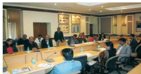
Participants during the workshop held under National Cyclone Risk Mitigation Project