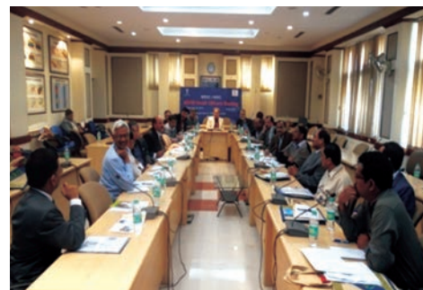
Representatives from various States and Departments at the NDEM meeting.