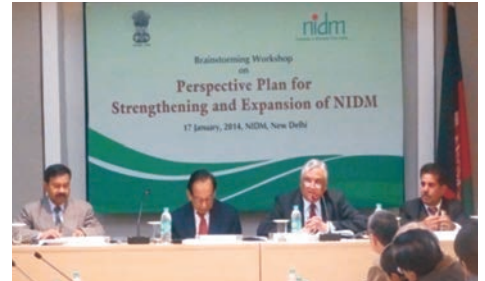
A discussion with the dignitaries during the brainstorming session.