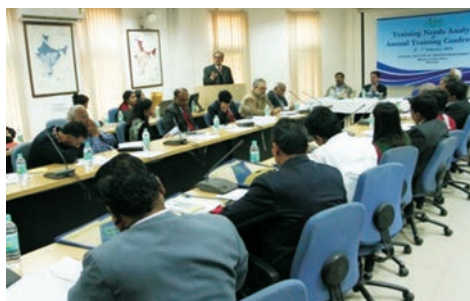
Shri Anil. K. Sinha, Hon'ble Vice Chairman, BSDMA.

The Training Needs Analysis (TNA) & Annual Training Conference (ATC) of the National Institute of Disaster Management (NIDM) was held on 6 th -7 th February, 2014 at NIDM, New Delhi. First Day of the Conference was devoted to Training Needs Analysis and the Second Day focused on Annual Training Conference. The emphasis for the current year was more on need based training courses, institutionalization of training and capacity building initiatives for disaster risk reduction and its mainstreaming in the programs of line departments/agencies. Shri Anil K. Sinha, Hon'ble Vice Chairman, Bihar State Disaster Management Authority (BSDMA) inaugurated the Conference. Prof. Vinod K. Sharma, Hon'ble Vice Chairman, Sikkim