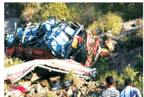
Bus wreckage at the tragedy site in Maharashtra.