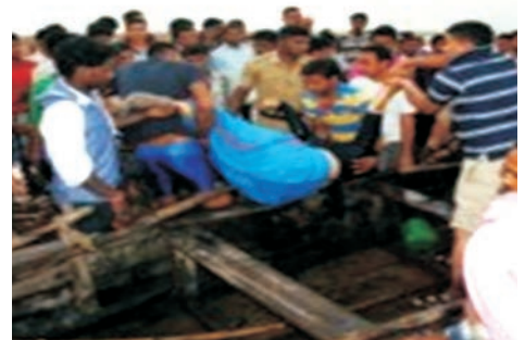
Image from the tragedy site.