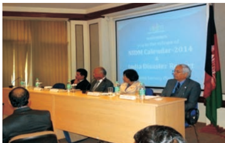
Dignitaries on the dais during the Calendar release function at NIDM.