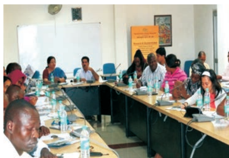
Participants from various countries during the workshop.