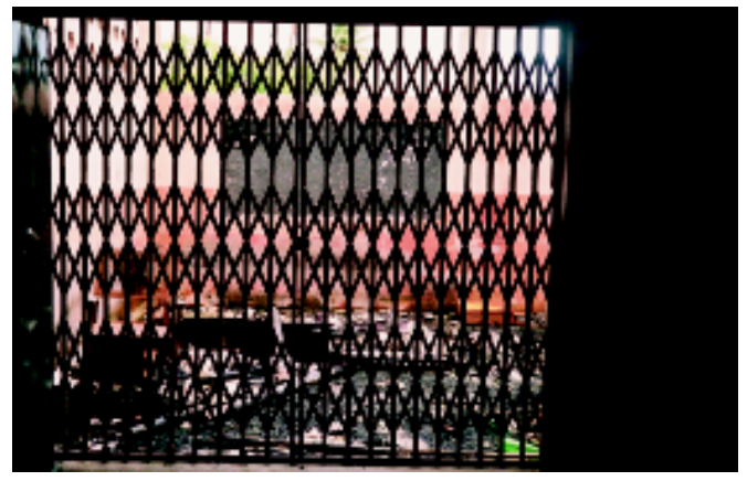
The collapsible door that sealed the fate of 93 children

and collapsed on the souls inside. Sixty-seven children died instantly; 16 children died in hospital, and another 21 children sustained grave injuries. Some of these survivors are still in hospital. Some parents lost two children in the school; some