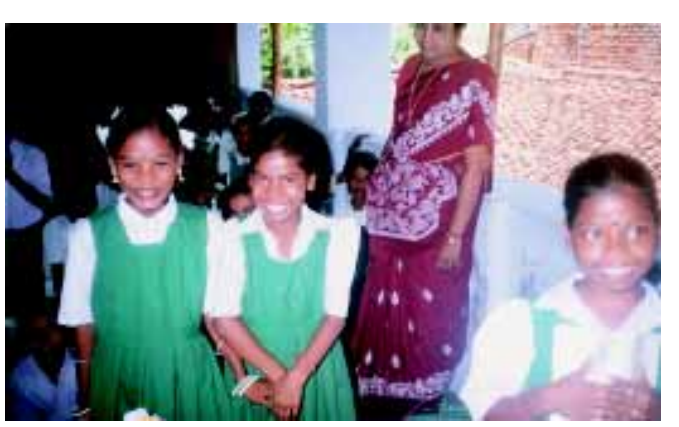
Awaiting an assurance for a disaster-free life

The strict enforcement of building safety rules for educational institutions is recommended. In addition it is critical to review the policies that granted recognition to schools prior to 1950. Training teachers and other staff in the schools, raising awareness of the children through the curriculum, and developing a district disaster management plan with due emphasis on such disasters, will go a long way to help prevent the reoccurrence of such heartbreaking tragedies in the future. A detailed report about the tragedy is under preparation.