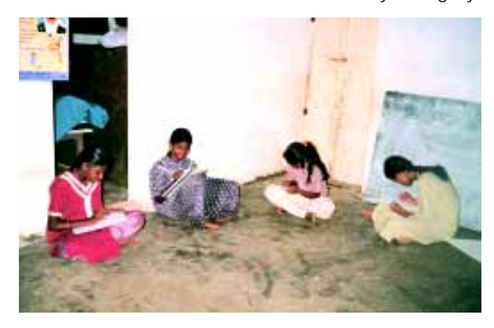
Traumatized siblings expressing through drawings