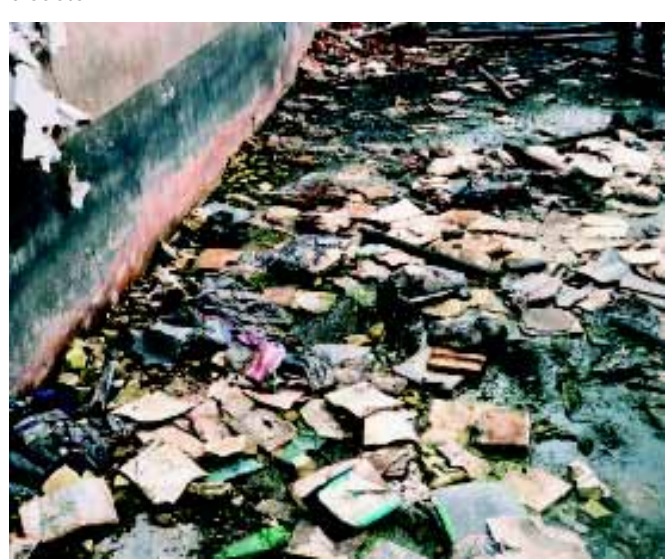
This is all that remained...

The response to the Kumbakonam fire and the relief efforts by the local community and the government, were well-organized and effective. The district collector of Thanjavur, Dr Radhakrishnan, reached the site of the tragedy in around 40 minutes. The following measures were taken to manage the disaster: