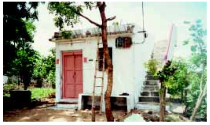
Government-built concrete house

A number of rehabilitative measures were taken by the administration to ensure the speedy recuperation of the community from this tragedy. Some of the measures, both short and long-term, that were undertaken in this regard are as follows: