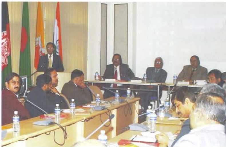
Inaugural Session of Annual Training conference

The Annual Training Conference of the NIDM was held on January 28-29, 2008 at the Conference Hall of the SAARC Disaster Management Centre, NIDM, New Delhi. Director Generals of State Administrative Training Institutes, Relief Commissioners, representatives of Central Ministries and Departments, Heads of Disaster Management Centers of the ATIs, and heads of the divisions and Faculty / Staff of the Training cell of NIDM attended this Conference.