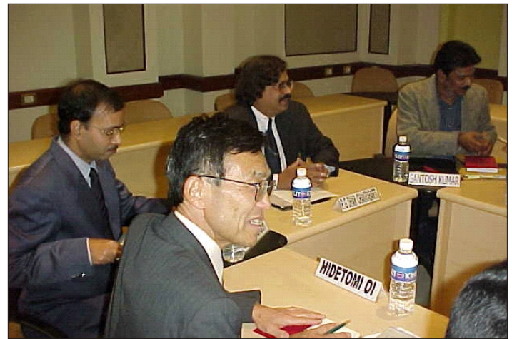
Meeting with Japanese delegation

Two project proposals of JICA on Earthquake and Tsunami Risk Reduction and Recovery for South Asian region were discussed. Both the projects will have two components: national and regional. The national components would be implemented through the national governments on the basis of priorities agreed with the governments, while the regional programmes are proposed to be implemented by the Bureau for Crisis Prevention and Recovery of UNDP through the SAARC Disaster Management Centre. The regional programme will address two components; (a) regional coordination, knowledge and networking, and (b) regional and international technical assistance for activities