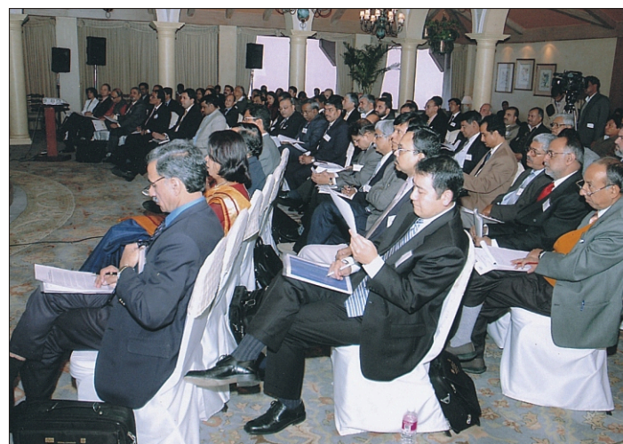
View of the Regional Conference at Taj Mahal Hotel, New Delhi