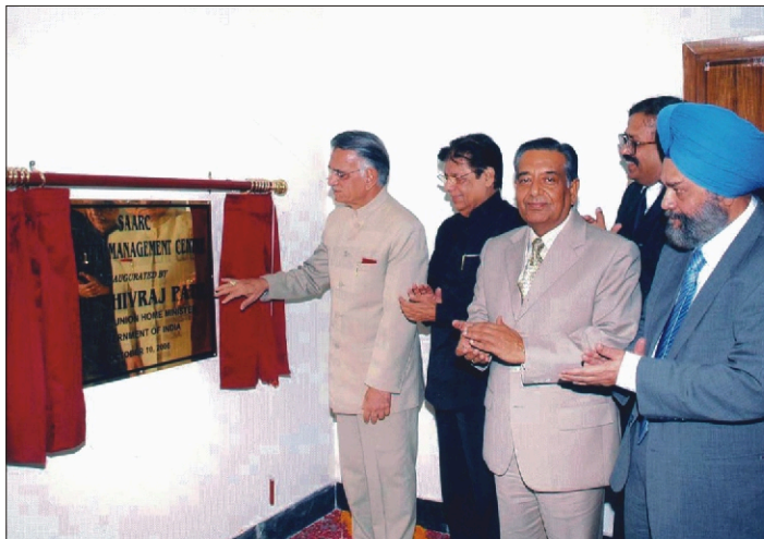
Mr. Shivraj V Patil, Hon'ble Minister of Home Affairs, inaugurating the SAARC Disaster Management Centre

The Centre shall have the following divisions, viz., Water and climate related disasters, Geologically related disasters, Human Induced & biological disasters, and Policy, Planning & Related Issues. Each Division shall have appropriate technical and other personnel to look after networking, documentation, finance, administration and other supportive functions.