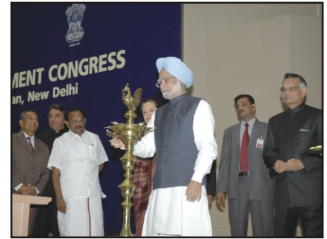
Prime Minister lighting ceremonial lamp