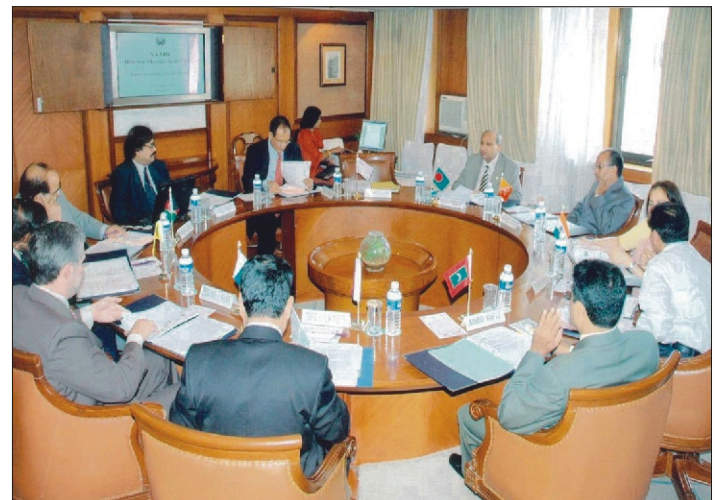
First meeting of Governing Body SAARC Disaster Management Centre on 9-10 October 2006

The SAARC Disaster Management Centre shall develop appropriate strategies for the performance of its functions, which includes the following: Network with the national focal points of disaster management and with the concerned regional and international bodies;