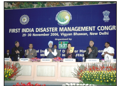
Mrs. Sonia Gandhi releasing book on Earthquake Safe Design