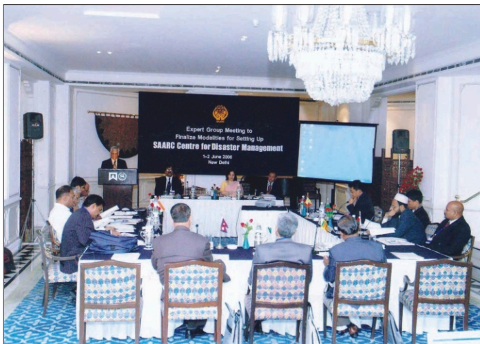
Expert Group Meeting for setting up SAARC Disaster Management Centre, 1-2 June 2006

The modalities for setting up the Centre were decided by an Expert Group Meeting at New Delhi on 1-2 June 2006. The Report of the Expert Group was accepted by the SAARC Council of Ministers in its meeting held at Dhaka on 30-31 July 2006. The Centre was inaugurated by Hon'ble Union Home Minister, Govt. of India, Shri Shivraj Patil, on Oct. 9, 2006 and its first meeting of the Governing Board of the Centre was also held on 9-10 October 2006 to approve the budget and program of activities of the Centre for the year 2007.