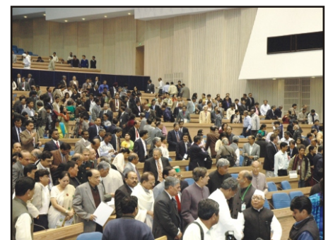
Participants of the Congress