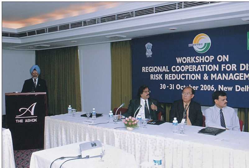
Presentations at BIMSTEC Workshop on Regional Cooperation on Disaster Management

Launched in 1997, the Bay of Bengal Initiative for Multi-Sectoral Technical and Economic Cooperation or BIMSTEC is one of the youngest of all organizations conceived to promote cooperation in our region. Aimed at providing a unique link between South Asia and South East Asia, BIMSTEC brings together nations bound by ties of history and culture to foster the cherished ideals of peace, freedom and economic well being. BIMSTEC is based on mutual interests and common concerns among member countries and complementarities of their economies.