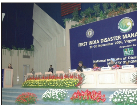
Mrs. Sonia Gandhi delivering the Keynote Address