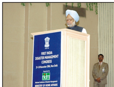
Prime Minister addressing