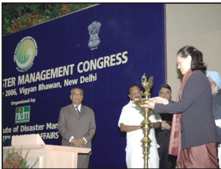
Mrs. Sonia Gandhi lighting ceremonial lamp