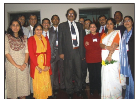
NIDM Team on the successful conclusion of the Congress