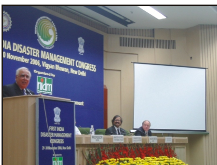
Minister for Science & Technology and Earth Sciences addressing