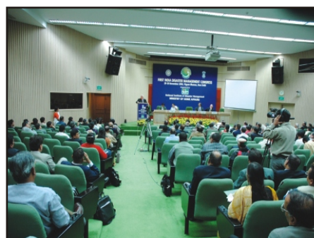
Congress in Session